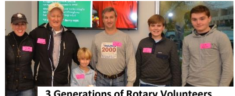
3 Generations of Rotary Volunteers