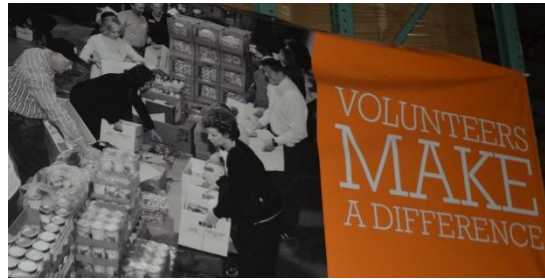
A careful look - ROTARY volunteers from Feed the Need