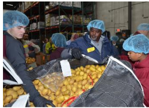
Rotary Club of Nashville Volunteer Room